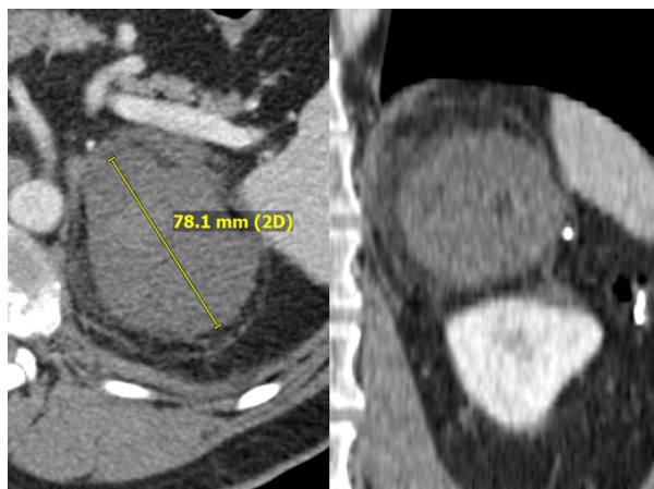
Figure 4. Axial and coronal image from 9-month post-procedure CT scan demonstrating left adrenal RCC metastasis without residual enhancement, now measuring 7.8 cm.