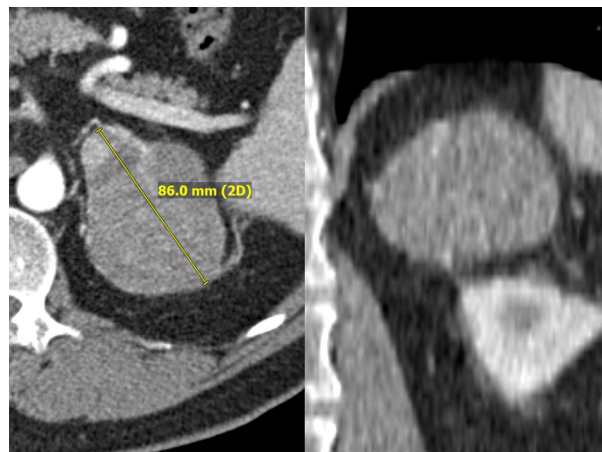
Figure 1. Axial and coronal image from pre-procedure CT scan demonstrating heterogeneously enhancing left adrenal RCC metastasis, measuring 8.6 cm. CT, computed tomography; RCC, renal cell carcinoma.

Institutional review board approval was not required for this report. A 59-year-old man with a history of stage 2 clear cell RCC status post total nephrectomy 13 years prior presented with cough, underwent computed tomography (CT) of the chest, and was found to have biopsy-proven metastatic disease in mediastinal lymph nodes. Additional sub-centimeter pulmonary nodules, hyper enhancing pancreatic lesions, and bilateral adrenal masses were discovered. The patient was started on axitinib and pembrolizumab, and over an 8-month period of observation on systemic therapy, there was interval stability of all sites of metastatic disease except for a growing left adrenal mass which now measured 8.6 cm (Figure 1). Interventional radiology was consulted for minimally invasive treatment of the left adrenal metastasis.